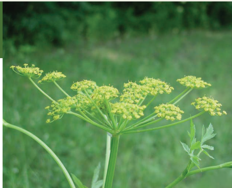
Flowers grow in yellowish-green clusters

In North America, scattered wild parsnip populations are found from British Columbia to California, and from Ontario to Florida. It has been reported in all provinces and territories of Canada except Nunavut. The plant is currently found throughout eastern and southern Ontario, and researchers believe it is spreading from east to west across the province.